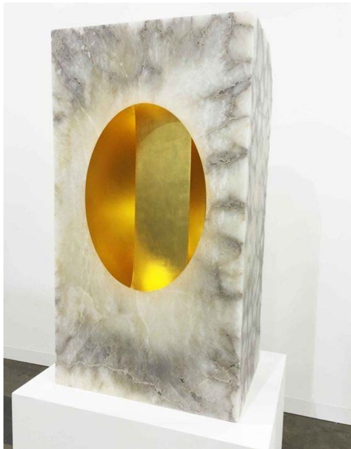
"The Host" by Anish Kapoor