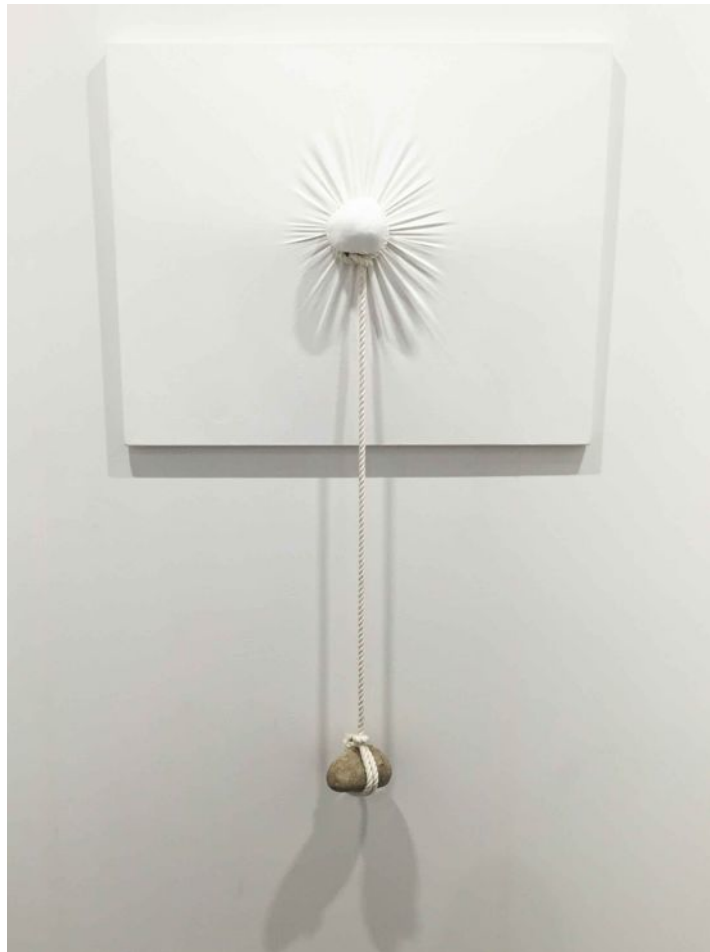
"Phase of Nothingness - Cloth and Stone" by Nobuo Sekine