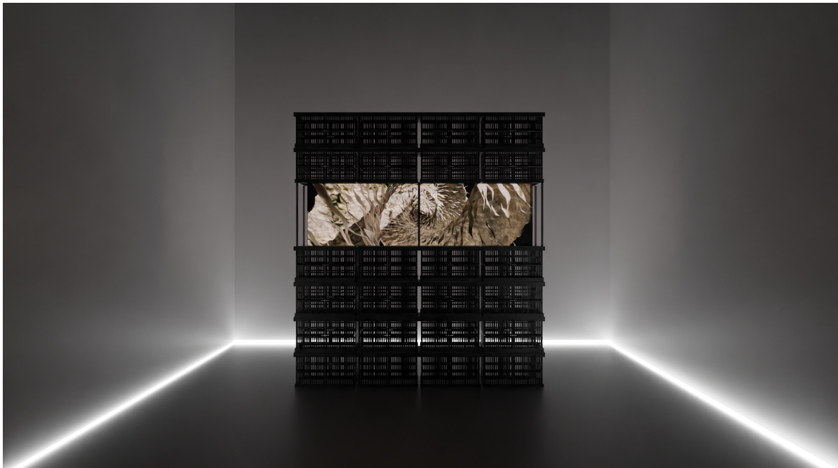
Image caption: Rendering, Harvest System Centre, 2023, 3D animation video, H.264, stereo sound, Installation: Black collapsible crates

Yeo Workshop is pleased to showcase a solo presentation of a new video work by Singaporean artist Priyageetha Dia for the second edition of Frieze Seoul. Dia's practice is concerned with speculative methods of counter-narratives that correspond to Southeast Asian postcolonial histories and the transnational migration of ethnic communities. Through poetic interventions using time-based and print mediums, specifically 3D animation and game engine software, Dia translates historical flashpoints into sensorial environments.