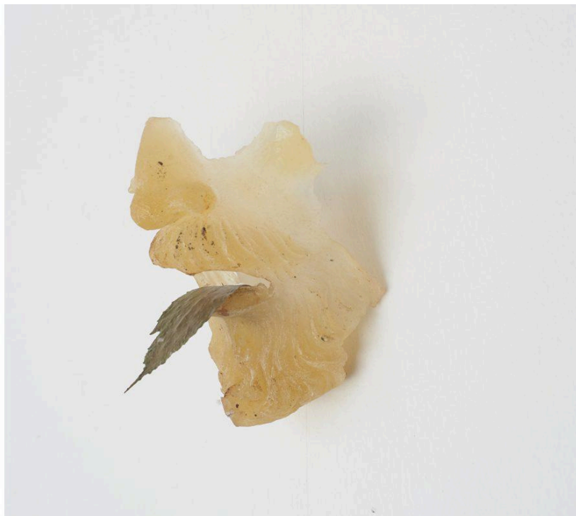
Filippo Sciascia, Primitive Mornings , 2020.