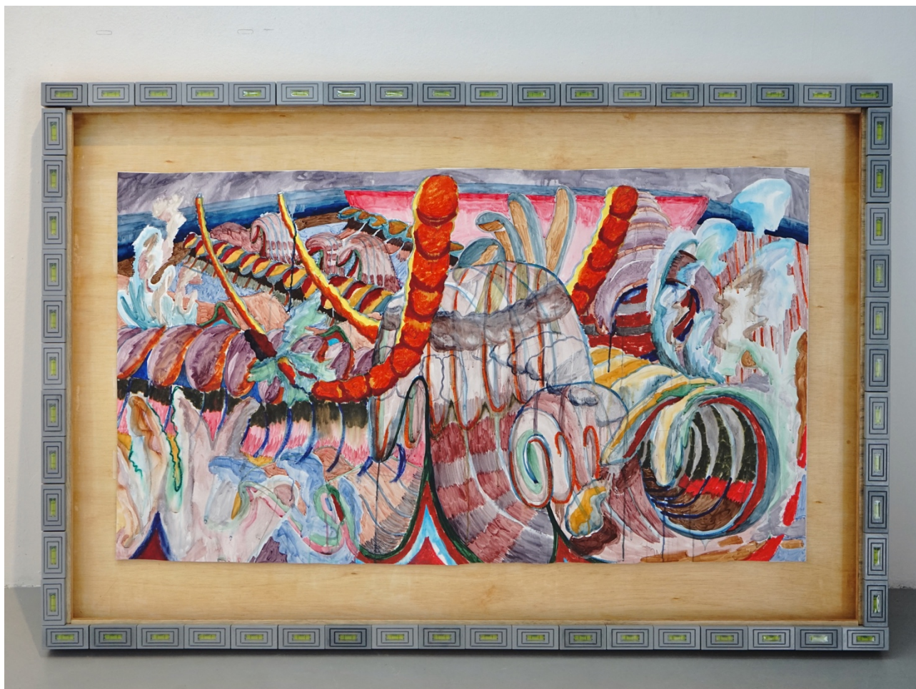
Image caption: Detailing on Twin Eyes. 2020, Watercolour on Paper, 150 x 80 cm