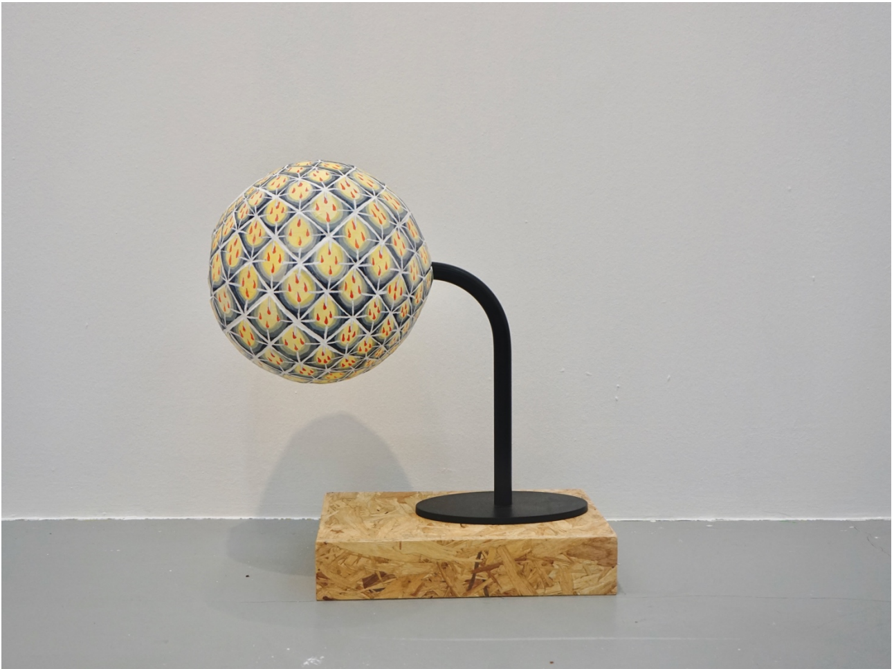
Image caption: Mike HJ Chang, Flame Always Points Up, Paper Mache Sculpture, Acrylic paint, Metal Stand