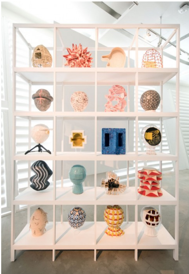
Pilots , 2017 by Mike HJ Chang Sculpture installation, mixed media, dimension variable