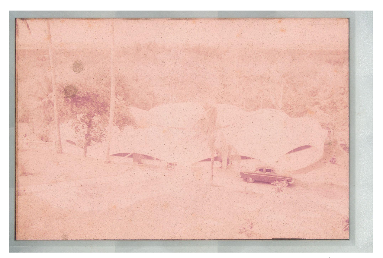
Wei Leng Tay, Untitled (car parked by building) , 2022. Archival Pigment Print. 40 x 30 cm. Edition of 3 + 1 AP.

This exhibition takes its title from the words printed on the cardboard slide mount of source photographs, which guides viewers towards a specific orientation of looking at the images. Here, it is an invitation for viewers to take a closer look at the materials and processes surrounding these works. Playing on this instruction, Tay essentially raises a central question that informs the premise of this show: what is this side from which to look? Though the works might seek to rationalise and address what is often maudlin and its affect on us, they create a space for looking and projecting, between abstraction and reminiscence. At the same time of remediating the past, these photo works call upon deeper reflection on the values that are associated with our own ways of seeing. How we look back upon ourselves might also be a mode of looking forward.