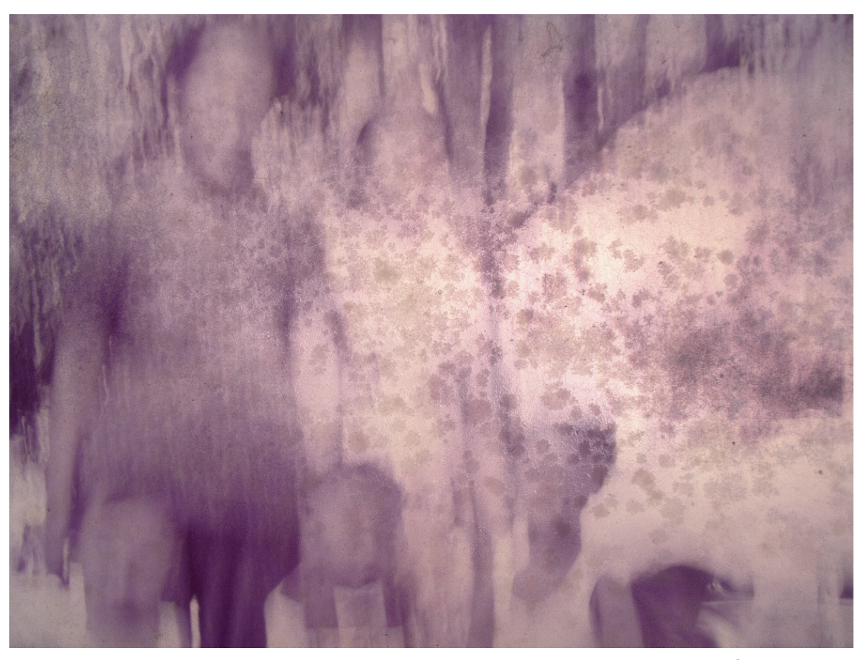
Wei Leng Tay, Untitled (cousins and relatives) , 2022. Archival Pigment Print. 60 x 45 cm. Edition of 3 + 1 AP.