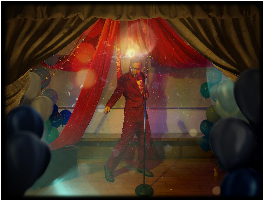
Image Captions: Dancing Without Touching , Sarah Choo Jing, video stills, 2023. Image courtesy: Sarah Choo Jing by Yeo Workshop