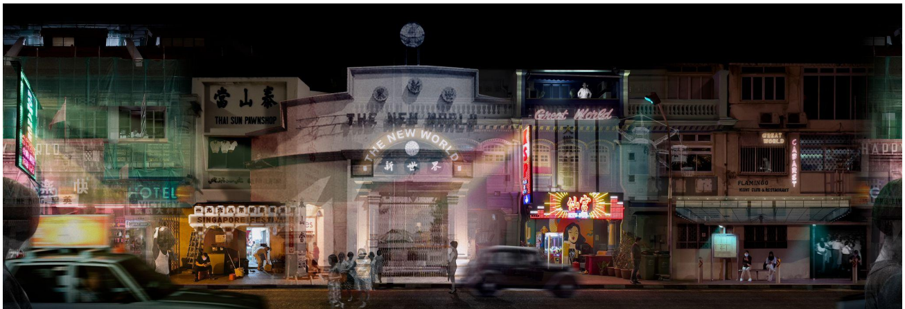
Image Caption: Sarah Choo Jing, Only nearer than half a world apart , 2022, Diasec Print, 51x150cm, Edition of 10.

Exhibition Dates: 7 Jan - 26 Feb 2023 (Singapore Art Week)