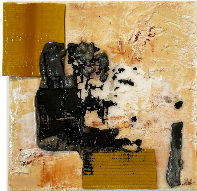
Maisarah Kamal, In Full Bloom I , 2023, Acrylic paint, found objects, cement, 30 x 30 cm.