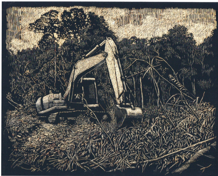
Maryanto, Clearing forest for palm , 2023, Scratching on photo paper, 20 x 25 cm.