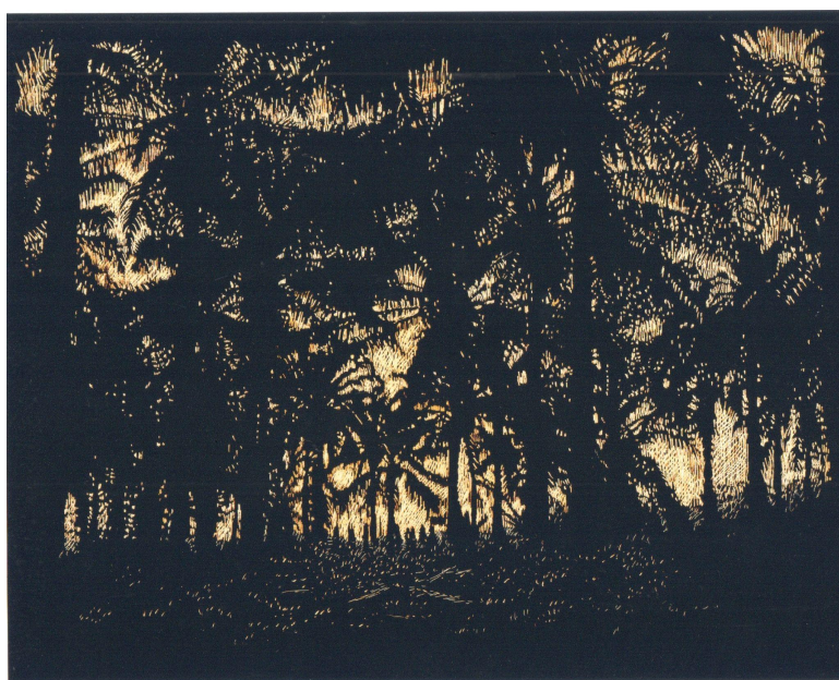
Maryanto, Old cemetery in a palm plantation , 2023, Scratching on photo paper, 20 x 25 cm.