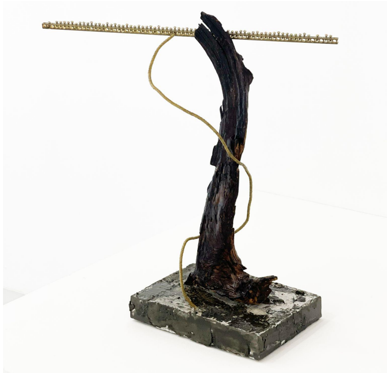
Maisarah Kamal, Bloom VI , 2023, Wood, cement, found objects, 62 x 54 x 22 cm.