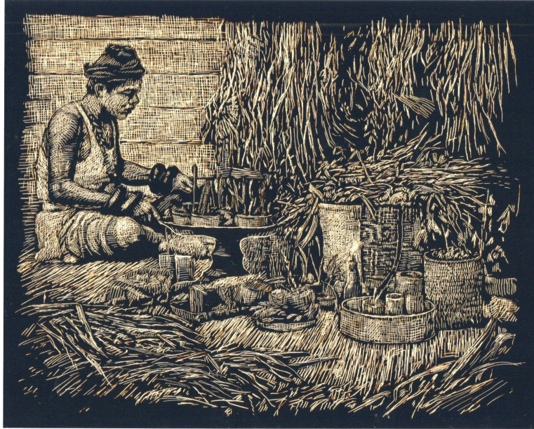
Maryanto, 'Mulung' in Belian ritual , 2023, Scratching on photo paper, 20 x 25 cm.