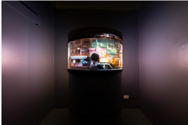
Sarah Choo Jing, Only nearer than half a world apart , 2023, Video sculpture, 63 x 100 x 100 cm.