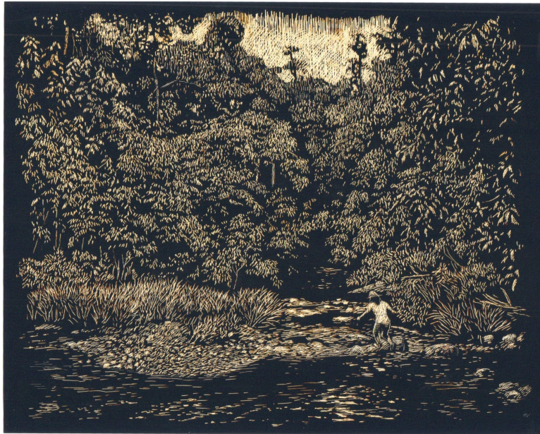
Maryanto, Water sources in forest areas , 2023, Scratching on photo paper, 20 x 25 cm.