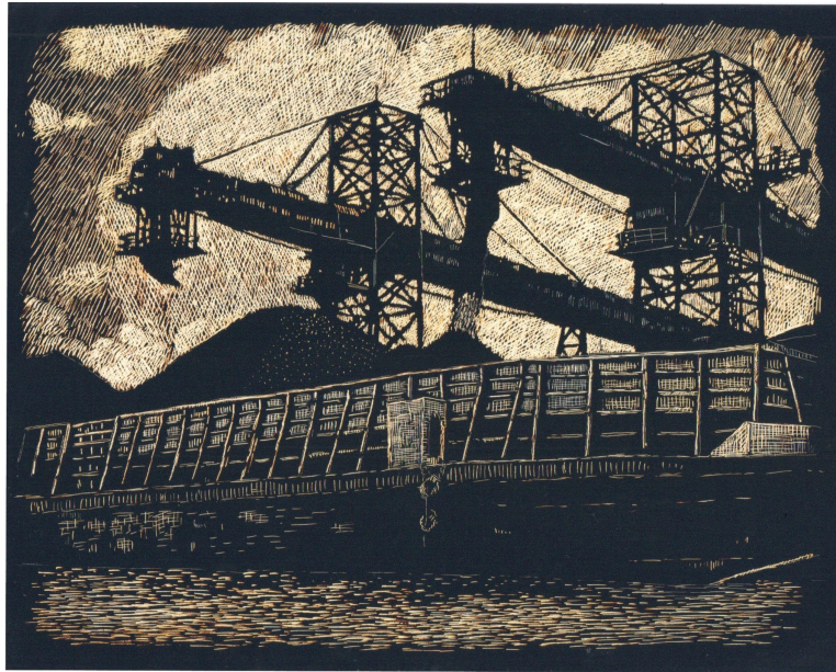
Maryanto, Coal port , 2023, Scratching on photo paper, 20 x 25 cm.