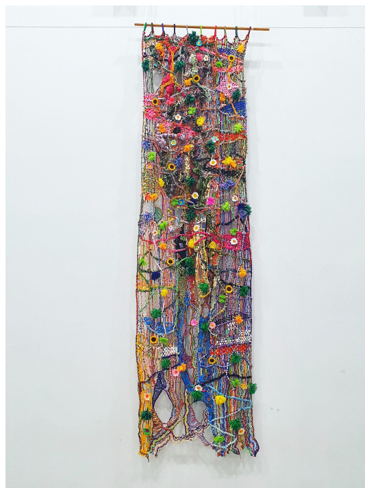
Santi Wangchuan, Color of life (No.2) , 2022, Rope, fabric and yarn, 350 x 100 cm.