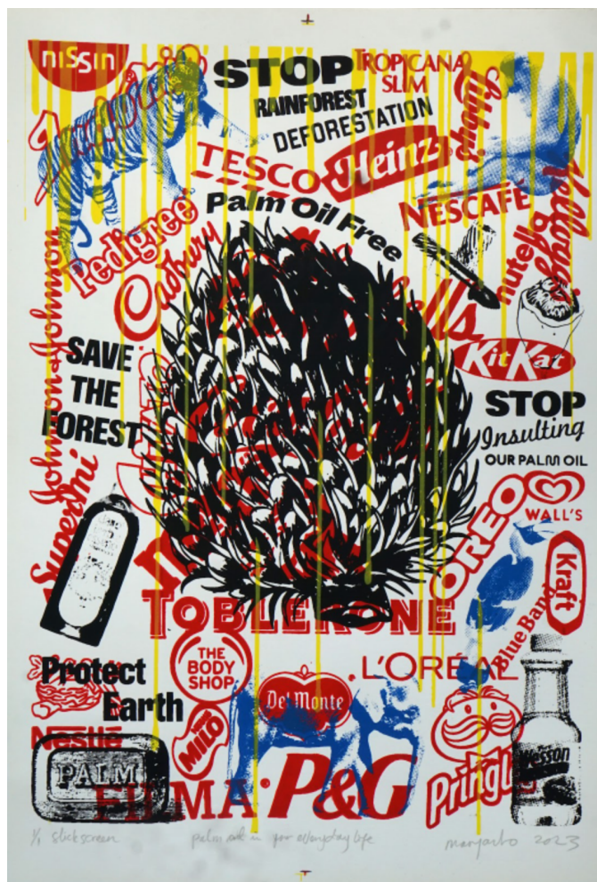
Maryanto, Palm oil in daily life , 2023, Silk screen print on paper, 51 x 35.5 cm.