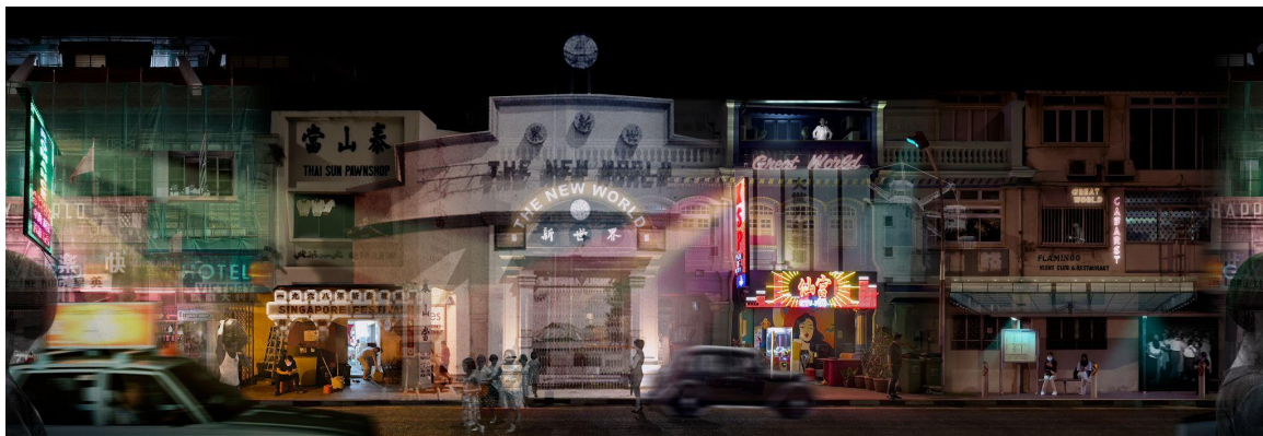
Image Caption: Sarah Choo Jing, Only nearer than half a world apart , 2023, diasec print, 51 x 150 cm.