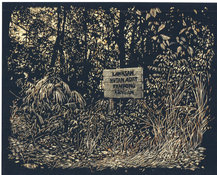
Maryanto, Customary forest area , 2023, Scratching on photo paper, 20 x 25 cm.