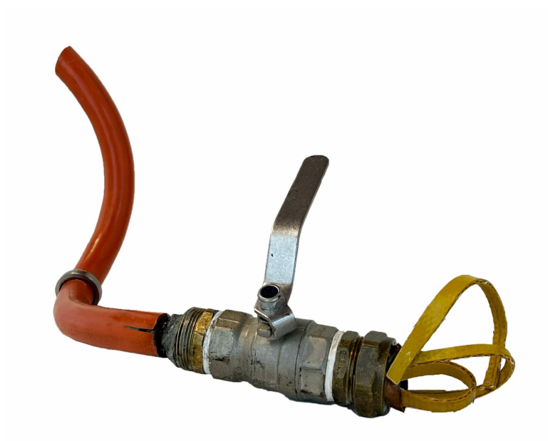
Maisarah Kamal, Bloom III , 2023, Wood, cement, found objects, 20 x 25 x 27 cm.