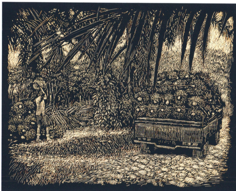
Maryanto, Oil palm harvest , 2023, Scratching on photo paper, 20 x 25 cm.