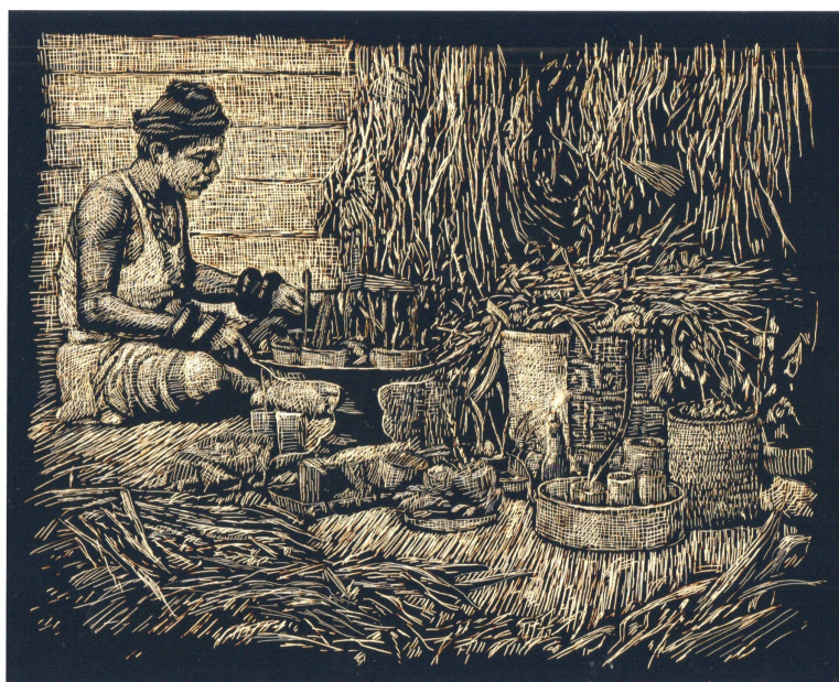
Image Caption: Maryanto, 'Mulung' in Belian ritual , 2023, scratching on photo paper, 2023, 20 x 25 cm

By challenging our perceptions of the everyday, Maryanto invites us to think critically about the world we live in and our place within it. In his recent series, he looks at our consumption of palm oil and its effects on deforestation. The work is a plea for us to participate and do our part to reduce consumption towards a more accountable world.