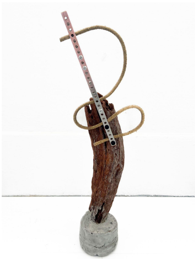
Maisarah Kamal, Bloom I , 2023, Wood, cement, found objects, 50 x 10 x 10 cm.