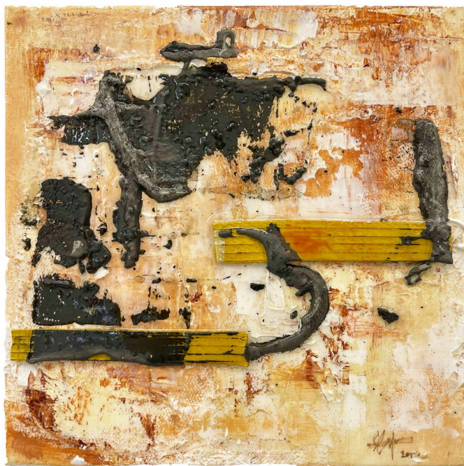
Maisarah Kamal, In Full Bloom III , 2023, Acrylic paint, found objects, cement, 30 x 30 cm.