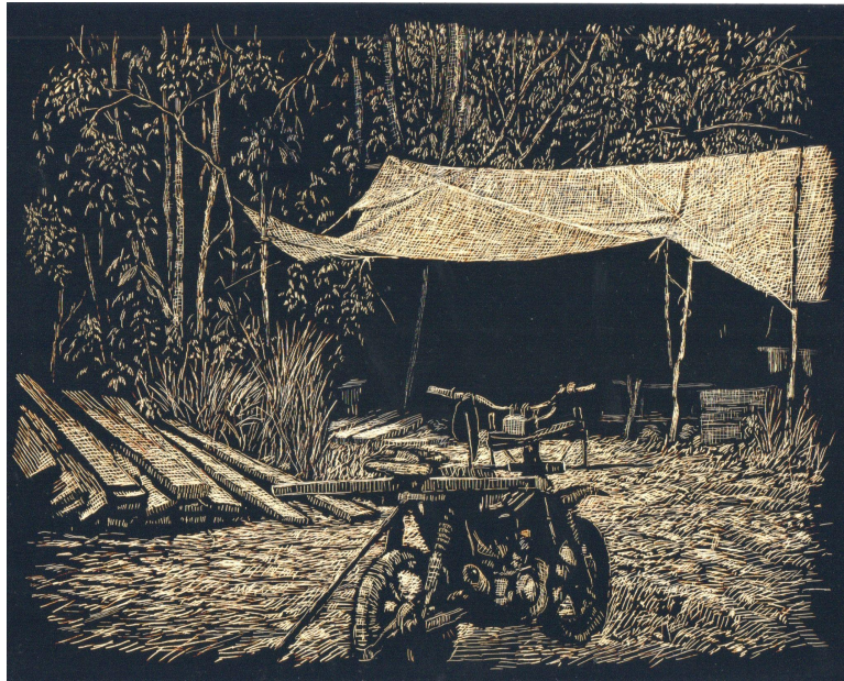
Maryanto, Illegal loggers , 2023, Scratching on photo paper, 20 x 25 cm.