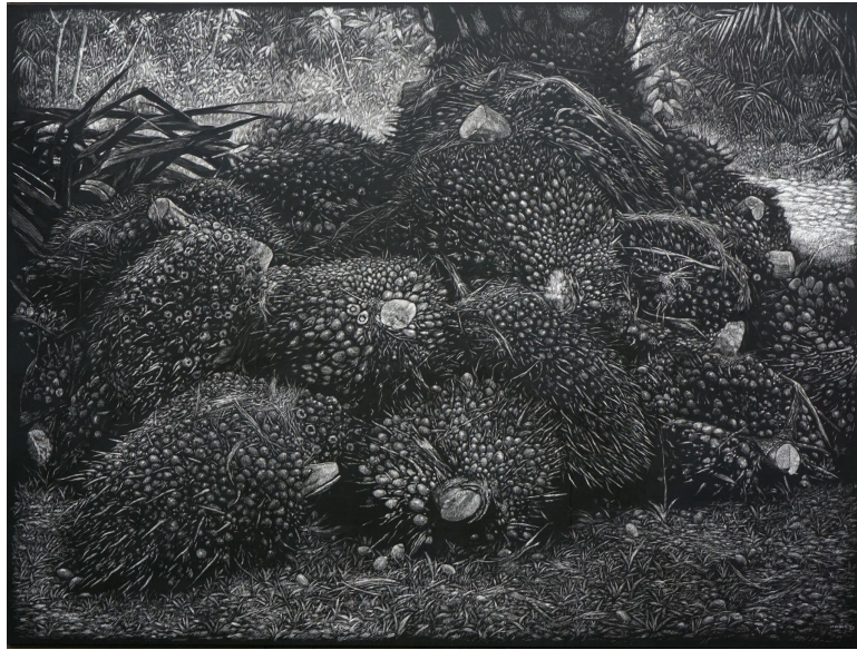
Maryanto, Fresh Fruit Bunch , 2023, acrylic on canvas, 150 x 200cm.