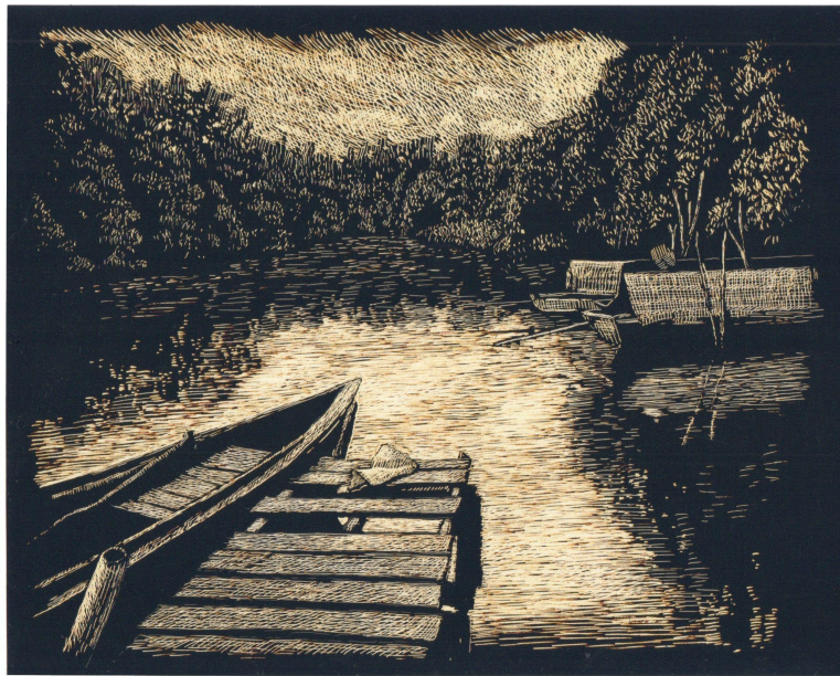
Maryanto, Mangrove forest , 2023, Scratching on photo paper, 20 x 25 cm.