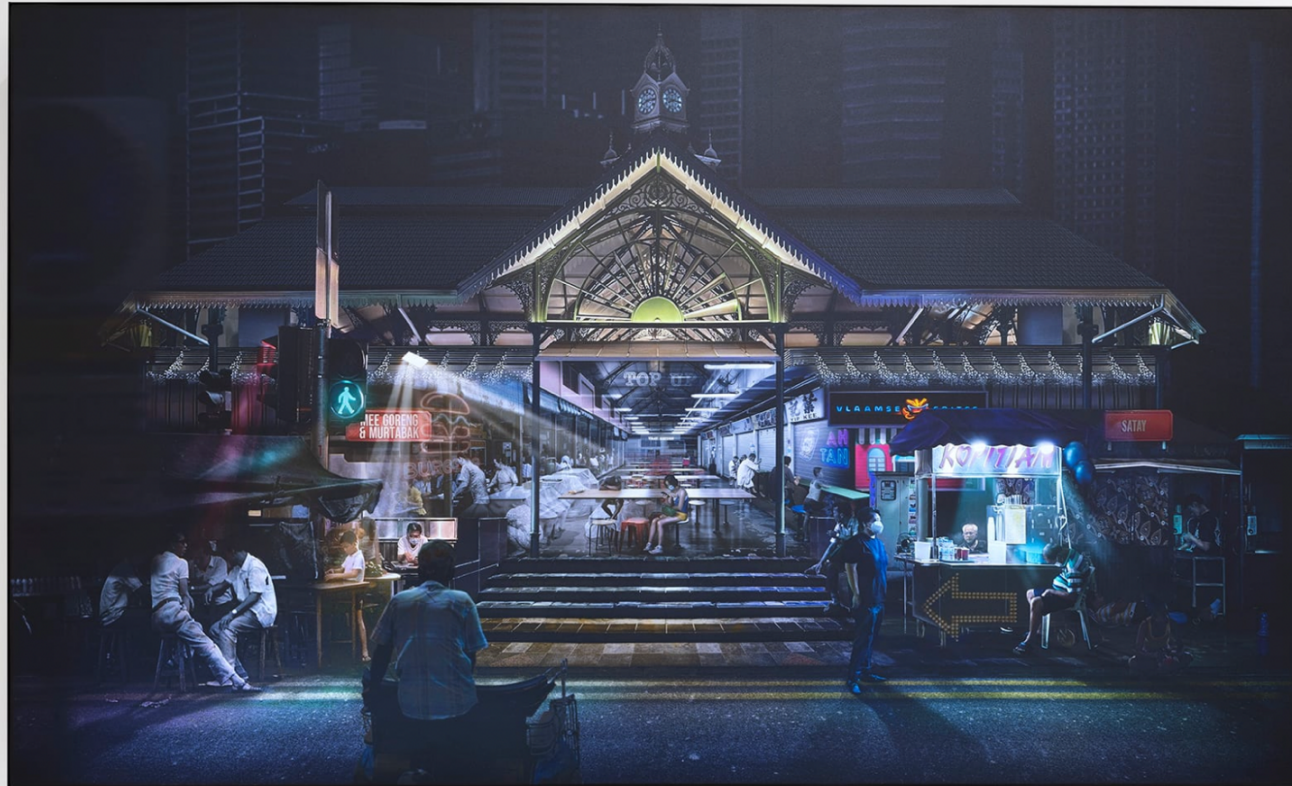
Sarah Choo Jing, not from here , 2021. Diasc Photography Print on Lightbox, 180 x 109 cm, edition of 5 + 1 AP