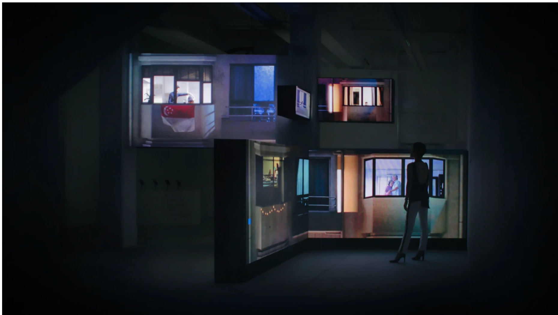
Sarah Choo Jing, Zoom, Click, Waltz , 2021. Multimedia installation comprising 13 LED screens with digital composites, dimensions variable.